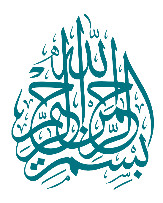
In the Name of Allah, the Most Gracious, the Most Merciful