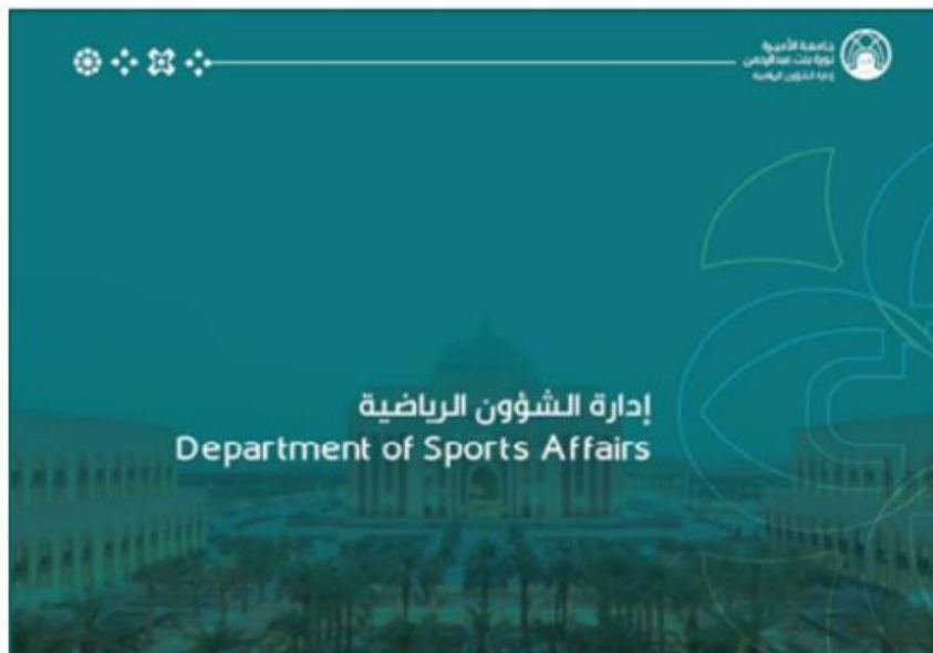
Department of Sports Affairs

PNU has launched a Higher Diploma program in Physical Education for Girls with the aim to prepare qualified cadres to find new job opportunities in the field of sports. It also established a new department, the Department of Sports Affairs, in order to utilize its sports facilities and create a sporting environment where female students are provided with the necessary knowledge and training in various sports disciplines and be able to participate in regional and international sporting events. It also aims at raising the level of community awareness about the importance of Saudi women's practice of sports and adopting a healthy lifestyle. Attached is the Department of Sports Affairs report which demonstrates the number of students who participated in different sporting competitions and community sporting events.