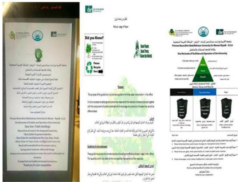
Figure(4). Brochures posted related to a two awareness programs prepared to encourage student and staff to reduce the use of paper and plastic.