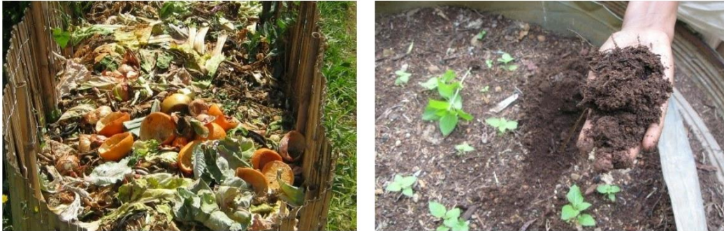
Figure(6).Organic waste Compost

Princess Nourah University has generated garbage separation policies. For this purpose, it has deployed containers in all university facilities that indicate what type of garbage to deposit and has conducted awareness campaigns about the importance of garbage separation. Furthermore, organic waste is not delivered to the collection service, it remains at the university in order to reuse organic waste as compost in gardens.