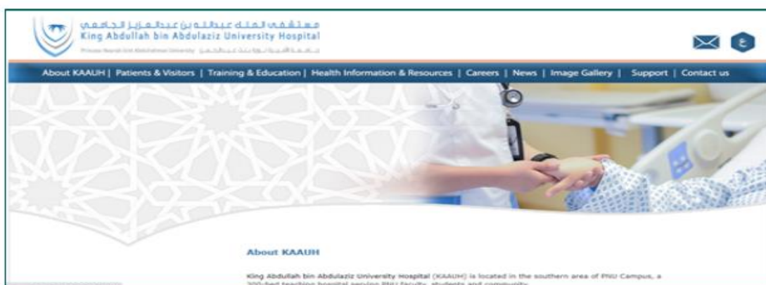
Figure 1. Source [1]

Princess Nourah bint Abdul Rahman University (PNU) has the King Abdullah bin Abdulaziz University Hospital (KAAUH) [1]. As part of the mission of the hospital, it is based on the integration of services provided with education and research that will bring the best knowledge and care to patients and students using the latest technology.