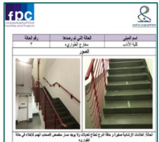
Facilities and projects