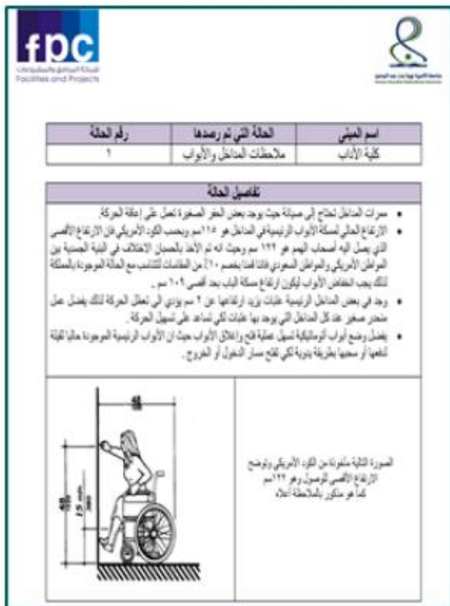
Facilities and projects