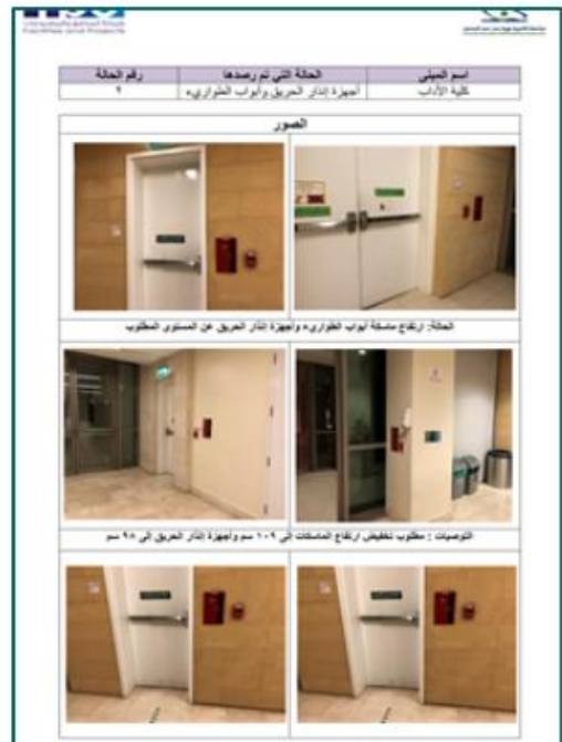
Facilities and projects