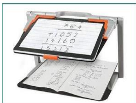
Universal Access Center

Princess Norah University has different teams to adapt to the special needs of its students