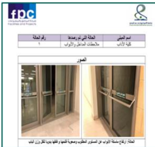
Facilities and projects