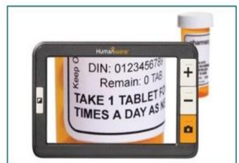
Universal Access Center